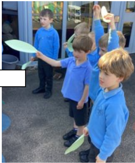
→ Class 1 learning about Palm Sunday.