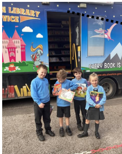
A visit from the Library bus.